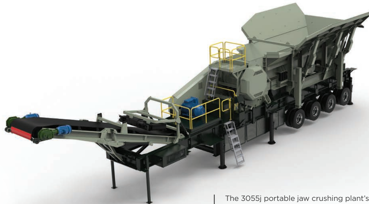
The 3055j portable jaw crushing plant’s impressive opposing wedge design, durable chassis, and wealth of features are suited for any application.