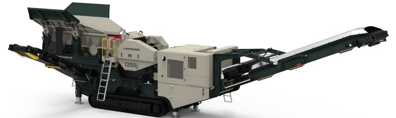
1200j electric heavy duty track-mounted jaw crusher utilizes a specialized jaw chamber to optimize material flow in even the toughest of applications.

Lippmann has taken its philosophy of building the toughest mobile wheel-mounted jaw crushers on the market and applied it to its newest offering, the track-mounted jaw crusher. Known throughout the industry for its unmatched production and reliability, the track-mounted jaw crusher features a stout, torsional resistance chassis design with oversized tracks and a rugged impactor. This cost-effective plant provides the ease of movement expected from a tracked machine to maneuver around aggregate and recycle operations.